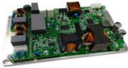
300W DC/DC Converter-Module