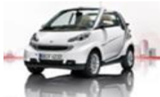
Electric Passenger Vehicles