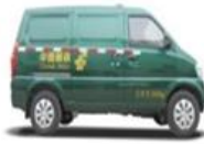
Electric Commercial Vehicles