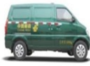
Electric Passenger Vehicles Electric Commercial Vehicles