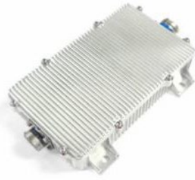
300W DC/DC Converter Natural Cooling System

Product Name : 300W DC/DC Converter Natural Cooling System