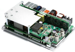
2.5KW DC/DC Converter Module